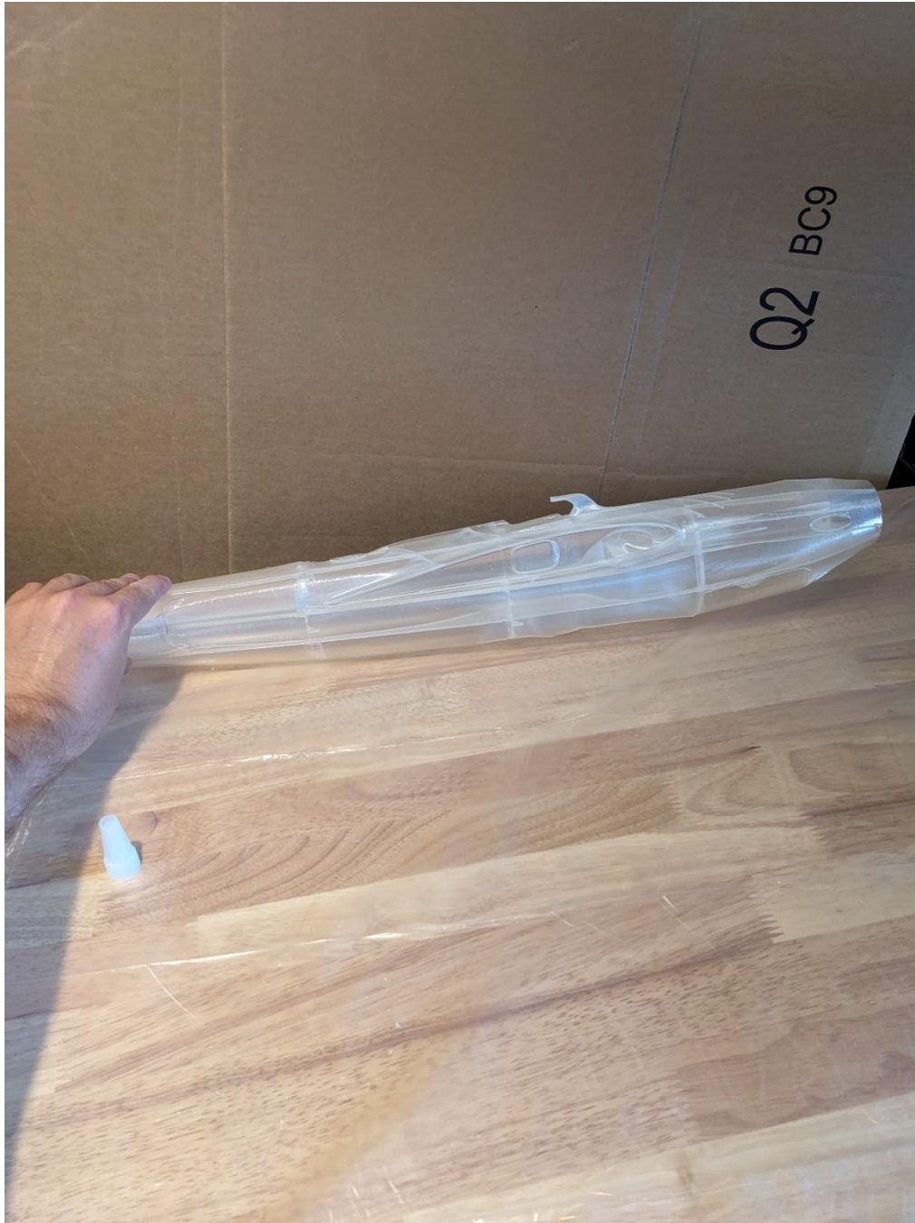
Fig 1-2: A completed fuselage.

A new P-38 will be printed and assembled in time for Saturday/Sunday display at the Binghamton airshow, as it was very popular demo model at the Ithaca pancake breakfast on Father's Day.