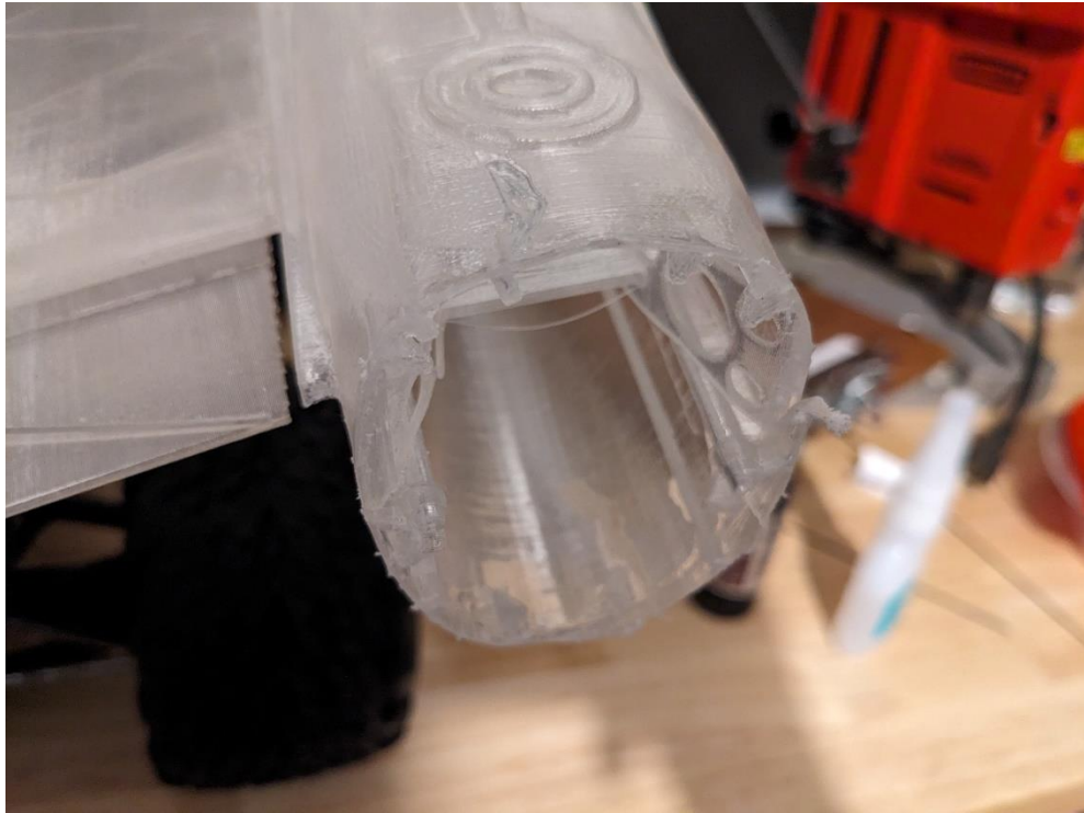
Fig 1-3: The right fuselage trimmed with a plastic-specific rotary too cutoff wheel