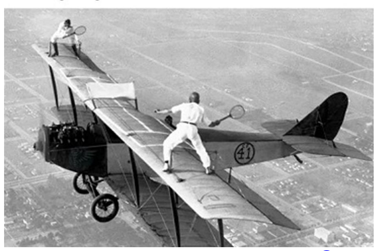
The dates don't add up but it is April 1st after all 😂