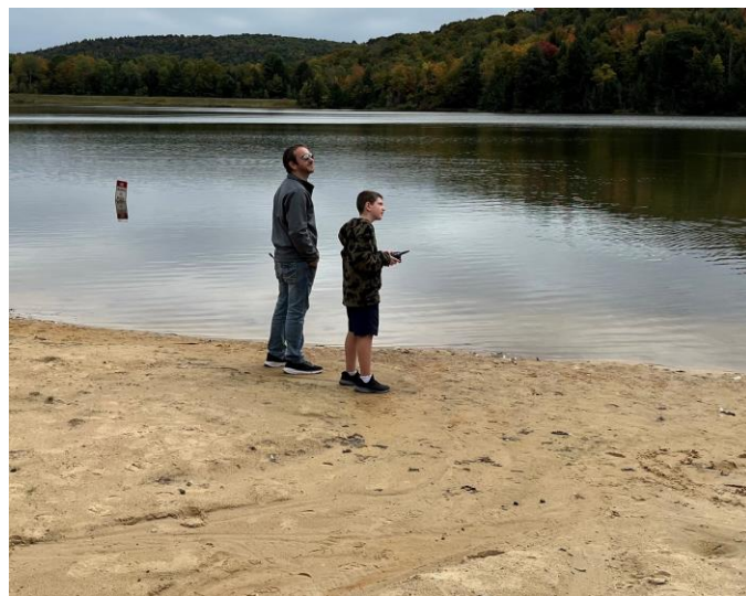
AGS Float Fly pics (submitted by Editor)