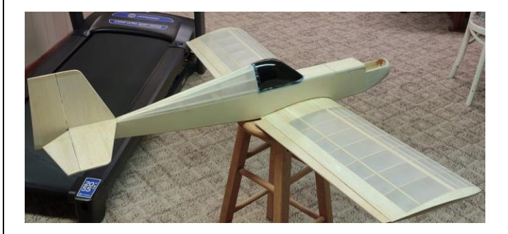
2) Winter project #2 1957 deBolt Super Cub in process

1) Winter project #1 Ace RC Bingo 40 ready for paint