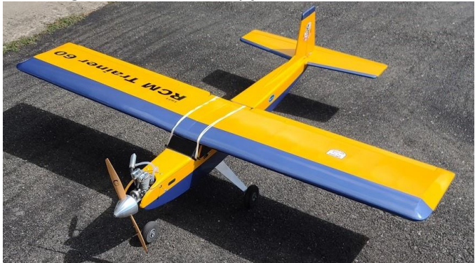
Scott Wallace's RCM trainer 60 with a Saito 56 reported to run like a Swiss watch!