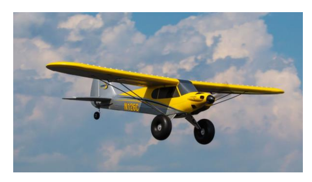
Originally purchased as a club trainer. Contact Bob Noll at 754-5279