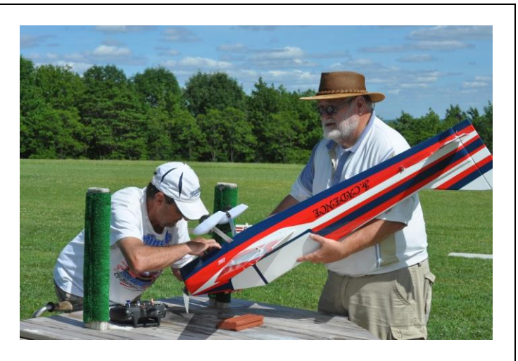
Jim Monaco's Pattern model