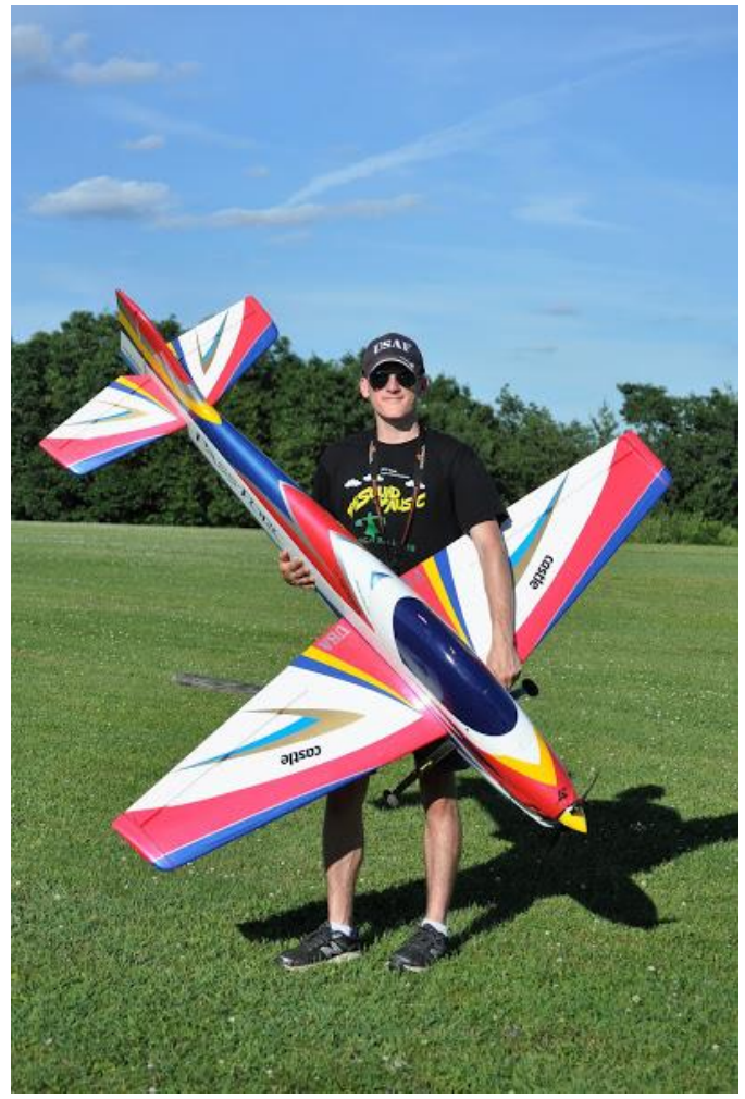
Cody Brown's Passport 2M Pattern model