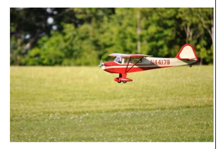
Taylorcraft on approach