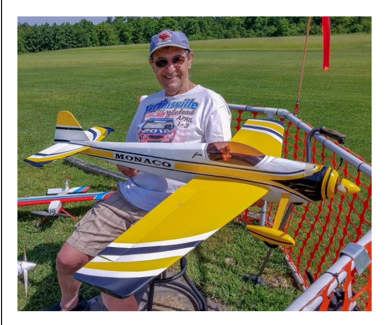
Jim Monaco's own design