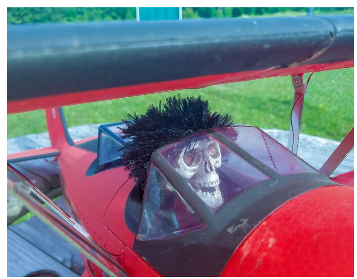
Pilot after studying for FAA Knowledge Test