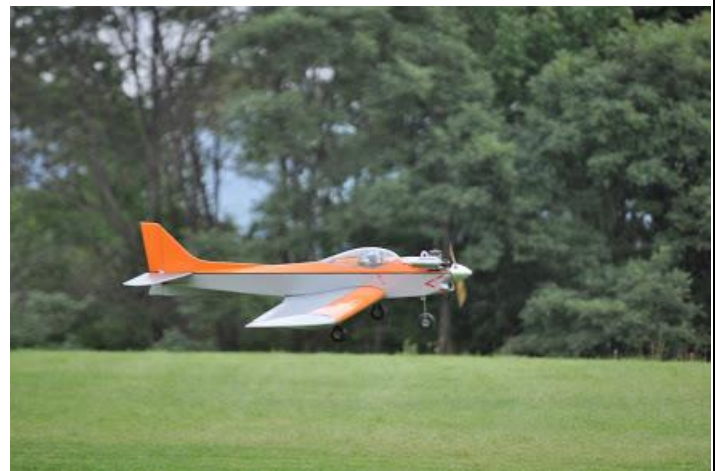
Tom Kozl's Contender (Theme Plane winner)