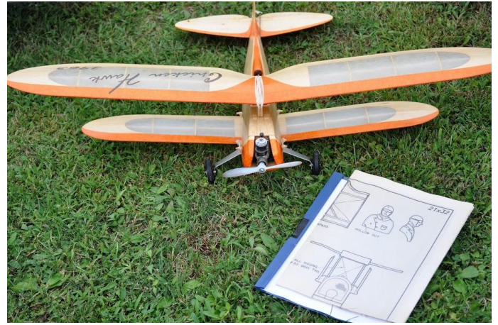
Doug Weaver's Concours winning "Chicken Hawk"

Ray and I marked the path to the tree with surveyors tape and wrapped tape around the very large tree trunk a day later. A call to a tree climber resulted in getting the Yankee back with no structural damage and only a few small holes in the covering. Careful inspection of the plane when I got it home revealed that I had not crimped the sleeve on the right cable at the rudder which had pulled loose. Dumb mistake!