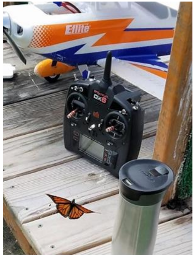
A curious butterfly