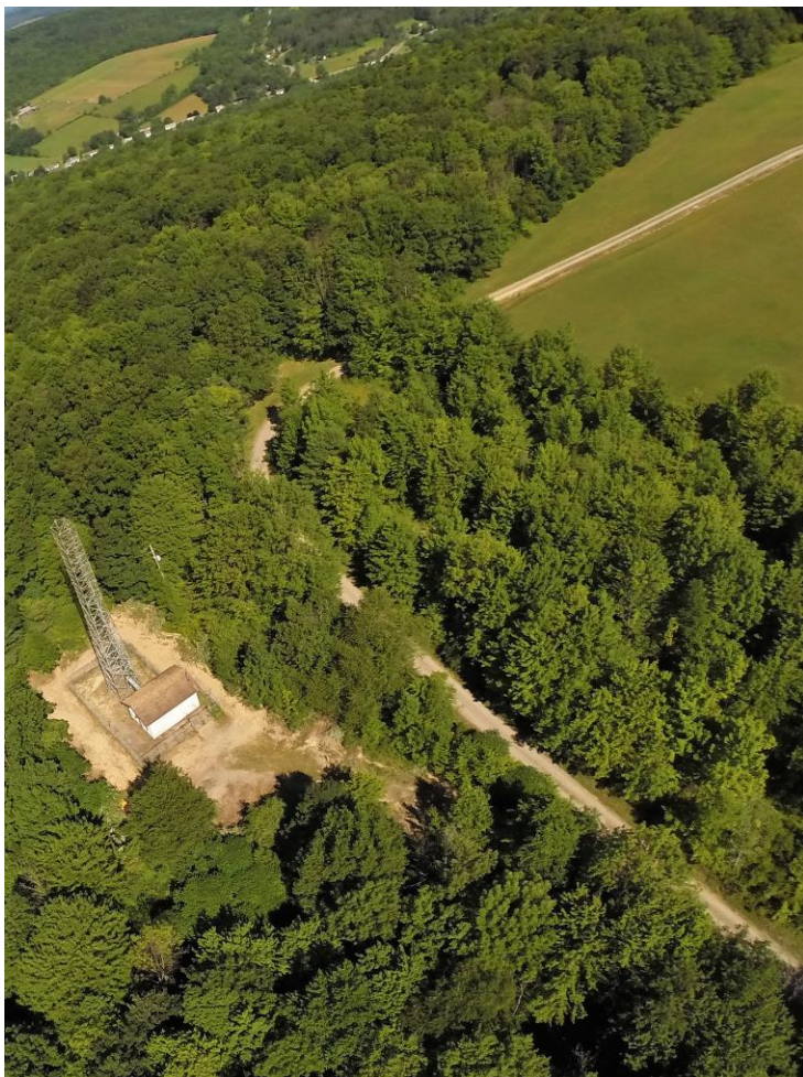
The tower off our runway has a new owner...