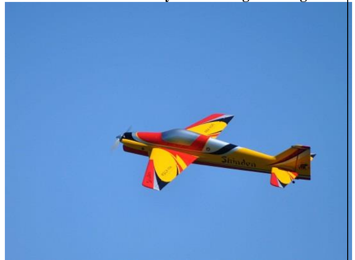
Neil Hunt's Shinden Pattern Model