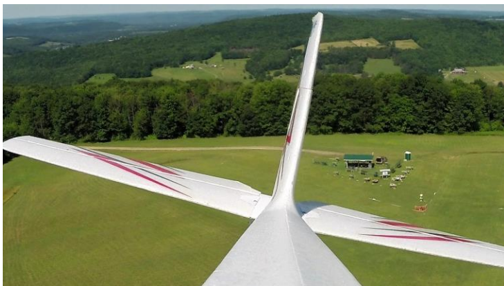
Awesome shot looking back at the field