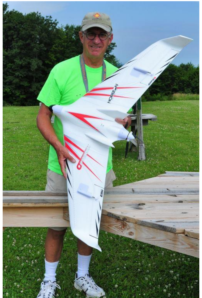
Bob Hoag's Opterra 1.2M flying wing (FPV ready)