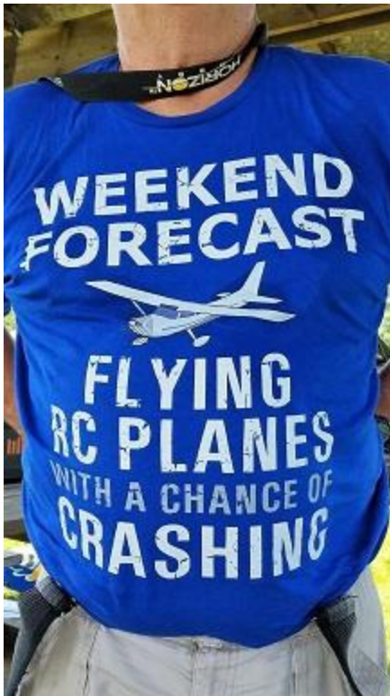
Bill Green's R/C forecast T Shirt