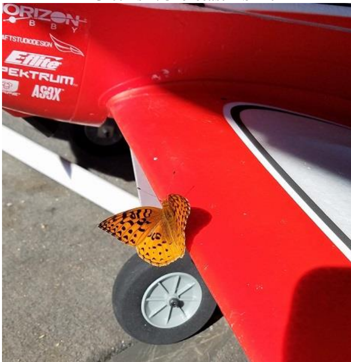
Bill Green's model picked up a hitchhiker