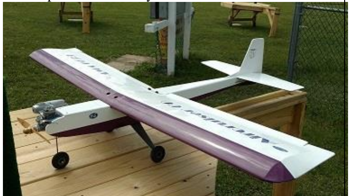
I should point out this excellent kit was a bargain at only $85 but the paint products to finish it were over $250!

At this point I just wanted the beast done and off my workbench, so the simplest two color scheme is what it ended up with. Behold my Bridi Aircruiser 60: