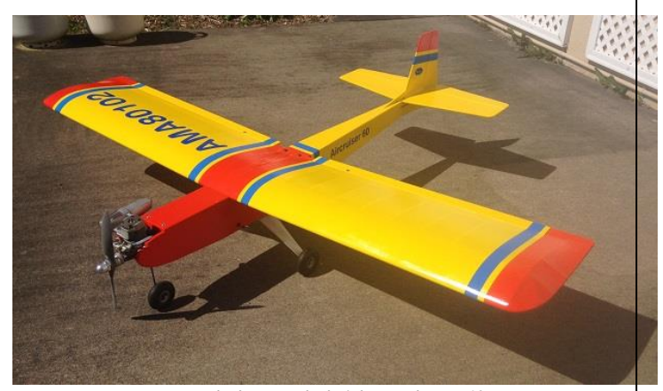
Ray Phillips Bridi Aircruiser 60

Ray and I bought these two Bridi kits at the same time, and as it worked both were finished up a year later. We both used dual aileron servos, and both changed to a bolt on wing instead of using rubber bands – but our solutions were different. I can report that mine flies great!