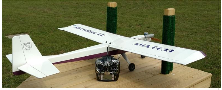
Scott Wallace's Bridi Aircruiser 60

Ray and I bought these two Bridi kits at the same time, and as it worked both were finished up a year later. We both used dual aileron servos, and both changed to a bolt on wing instead of using rubber bands – but our solutions were different. I can report that mine flies great!