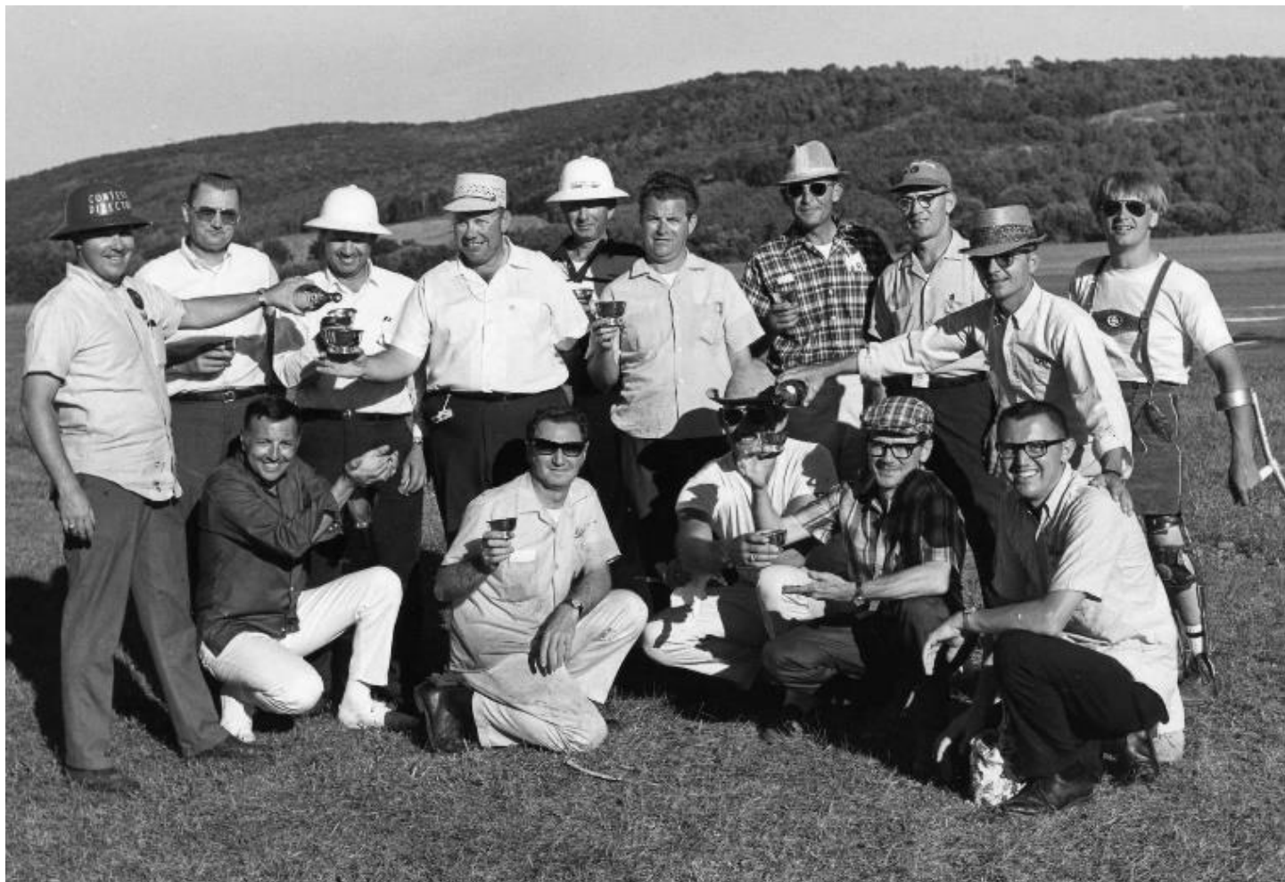
An old AGS contest photo – how many can you name?