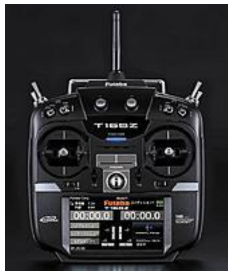
New Futaba 16SZ Coming Soon – Looks Good!

AMA membership is an AGS requirement to remain a member in good standing.