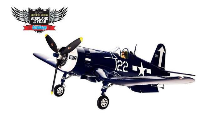
F4U-1D Corsair 60cc ARF by Hangar 9

• Note: A Holiday Party is under consideration.