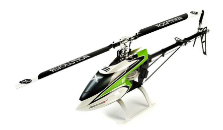
550 X Pro Series Combo by Blade