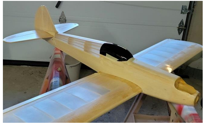
VRCS photos submitted by editor- great event!