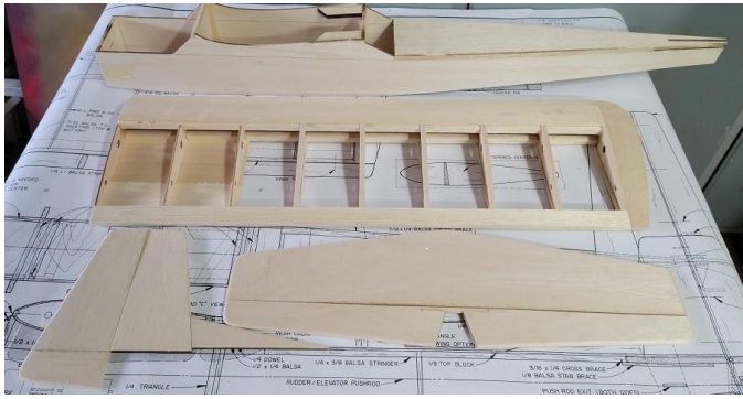
Todd Kopl's SIG Doubler II project (note: some minor sanding required)