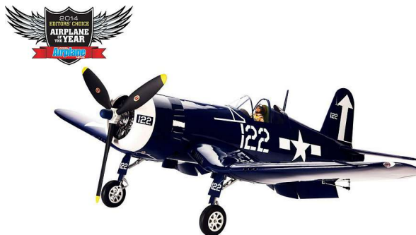
F4U-1D Corsair 60cc ARF by Hangar 9