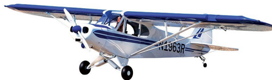
1/4 Scale PA-18 Super Cub ARF by Hangar 9